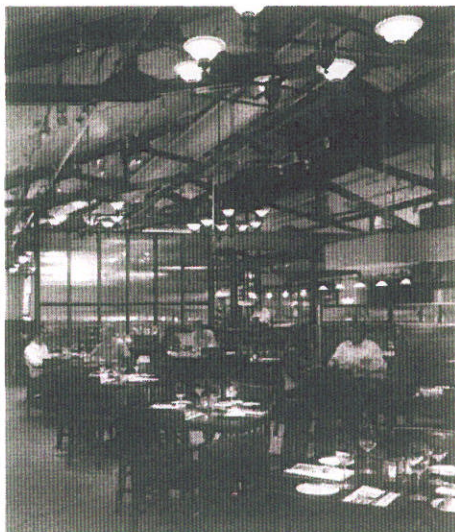
Bistro Boudin Dining Room.

Located at 160 Jefferson Street, the Boudin can be reached at www.boudinbakery.com or 415-928-1849. ■